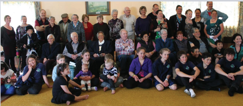
Kaingaroa and Te One schools in full 'waiata'