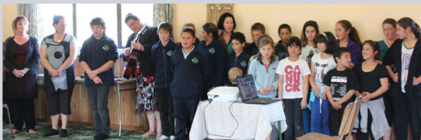
Kaingaroa and Te One schools in full 'waiata'

Looking forward to the Christmas lunch with our Kaumātua.