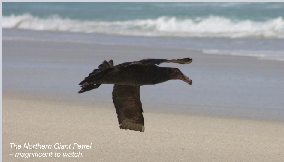
The Northern Giant Petrel – magnificent to watch.