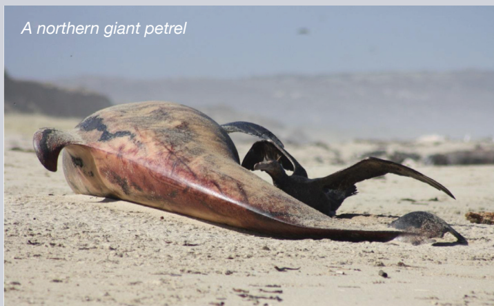
A northern giant petrel