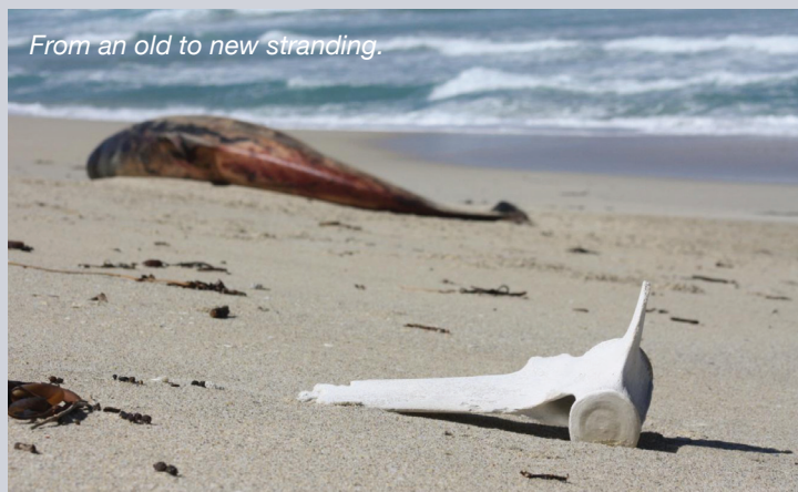
From an old to new stranding.