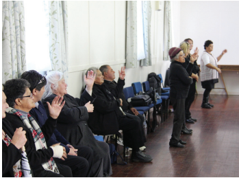
Kapahaka practice with Tu Mai Taranaki group