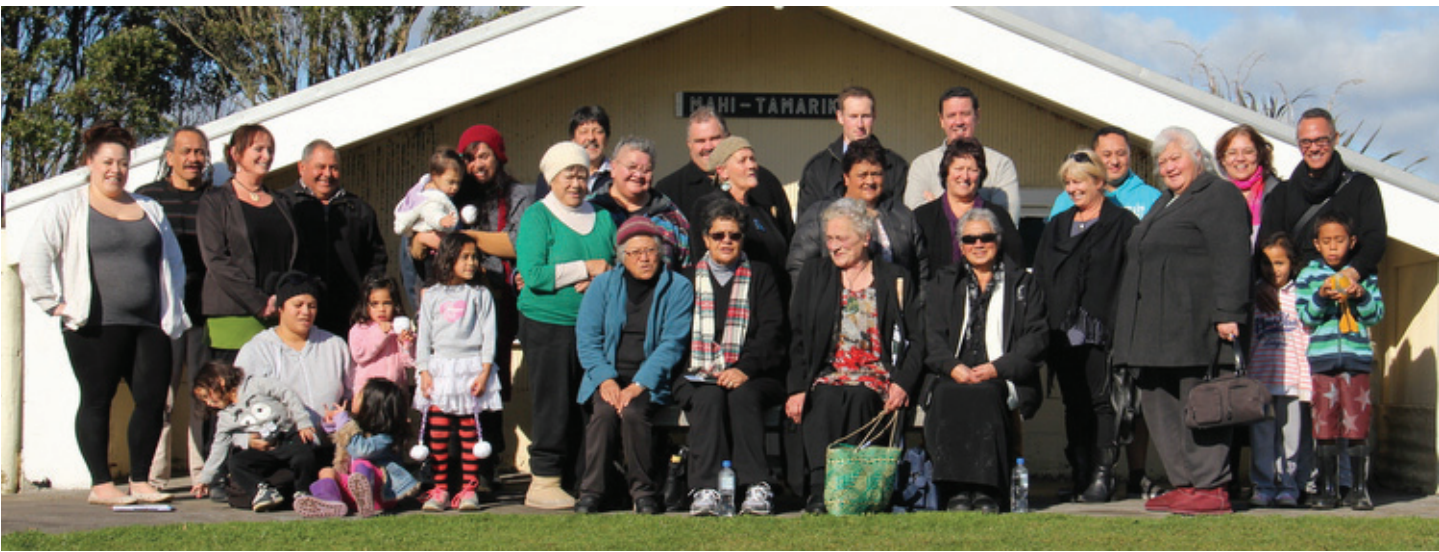
Settlement wananga at Urenui Pa July 2015